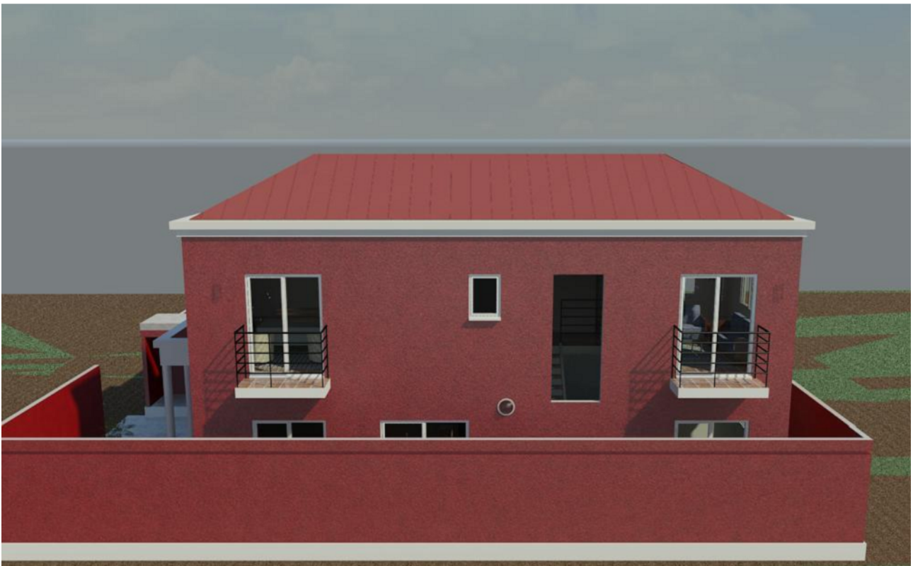
Vue 3D 13_23